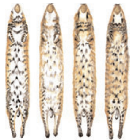
(a) Clear (b) Slight Off (c) Off (d) Stained CLARITY CATEGORIES OF THE LYNX CAT

NOTE: It should be noted that the Lynx Cat are CITES species.