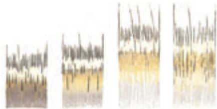
(a) very early (b) slightly early (c) prime (d) late

Southern: The Southern section contains cats from the Southern United States. The cats are generally very flat, bellies are off colour and backs are darker and sometimes very spotted. Southern cats are often called "Bobcats".