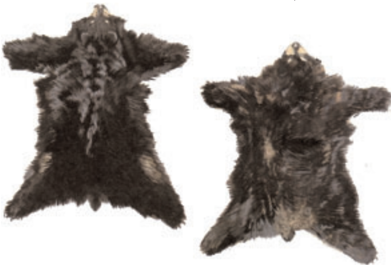
PRIMING SEQUENCE OF BLACK BEAR