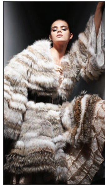
NAFA Northern Coyote and Raccoon [Part of NAFA's 2008-2009 International Campaign]