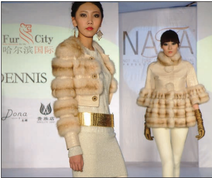
NAFA Northern Bleached Marten