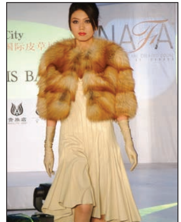
NAFA Northern Red Fox